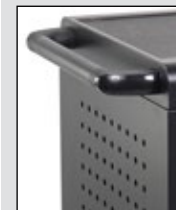
Padded Push Handle