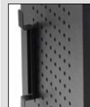
External Cord Wrap/Storage