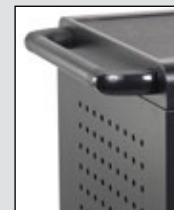
Padded Push Handle