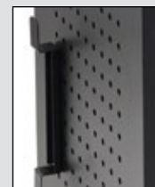
External Cord Wrap/Storage