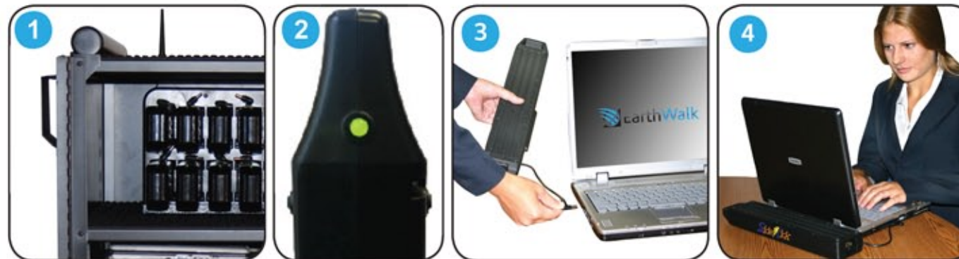
eBUDDY Laptops configurations vary by model