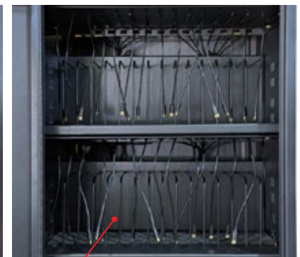
Vertical storage of devices with rubber-coated dividers