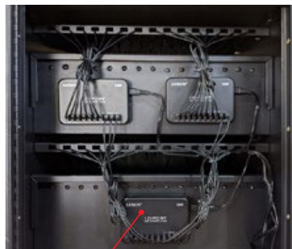
Integrated iCharge system w/ pre-wired USB-C charging cables