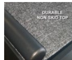
DURABLE NON-SKID TOP

The MM24-ESPORT mobile computer cart is designed to deploy up to 24 high-powered gaming devices with up to 17" screens. It also provides extra-secure storage space for your ESPORT accessories. Horizontal device storage design greatly reduces potential wear and tear on devices.